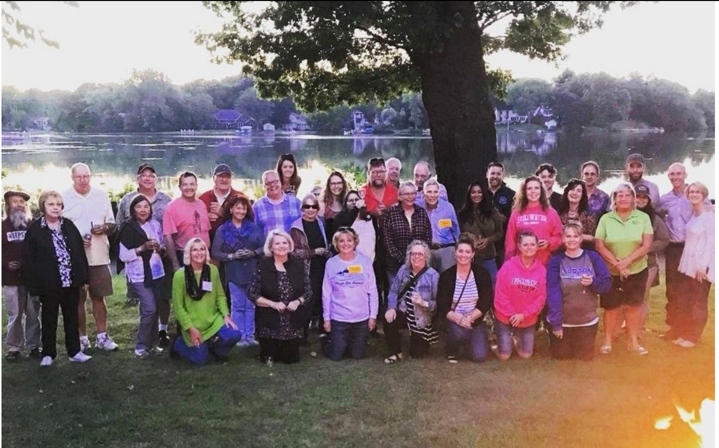
2018 Wine Tasting Event in September – great crowd!!!